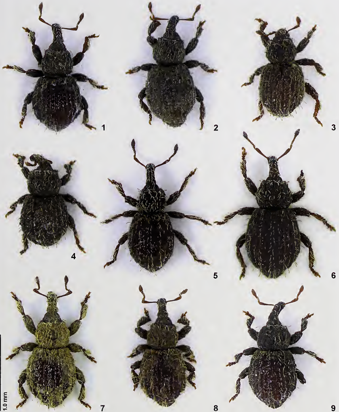
Figs 1-9. Habitus of Styphlidius spp. (1) S. italicus Osella, 1981 (Aspromonte, male). (2) Ditto (female). (3) S. brevisetis Osella, 1981 (Kefalonia, male). (4) Ditto (female). (5) S. pelops sp. nov. (Mesohori, male). (6) Ditto (W Agias Sofia, female). (7) S. corcyreus (Reitter, 1884) (Kilkis, male). (8) Ditto (Igoumenitsa, female). (9) Ditto (Reza e kalalit, female).